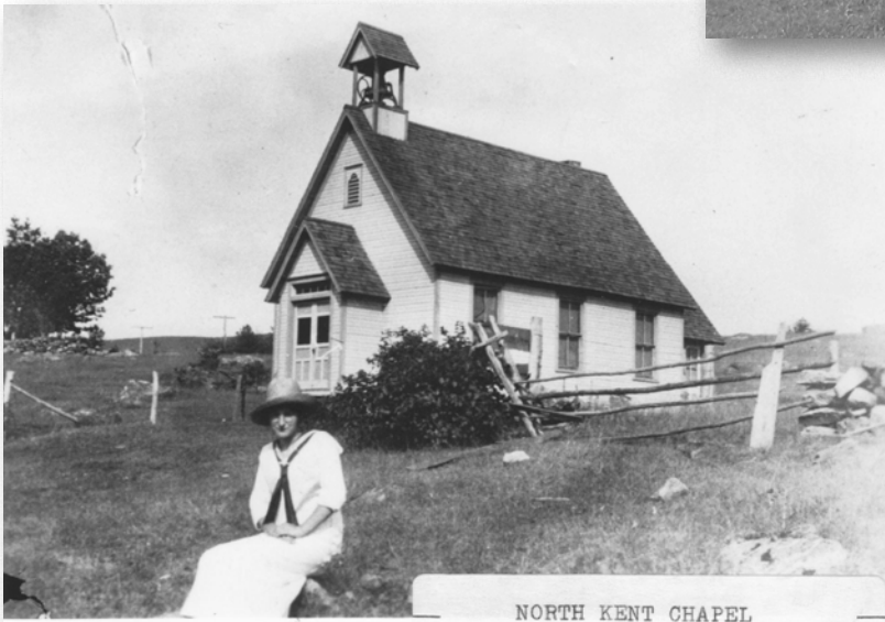
NORTH KENT CHAPEL